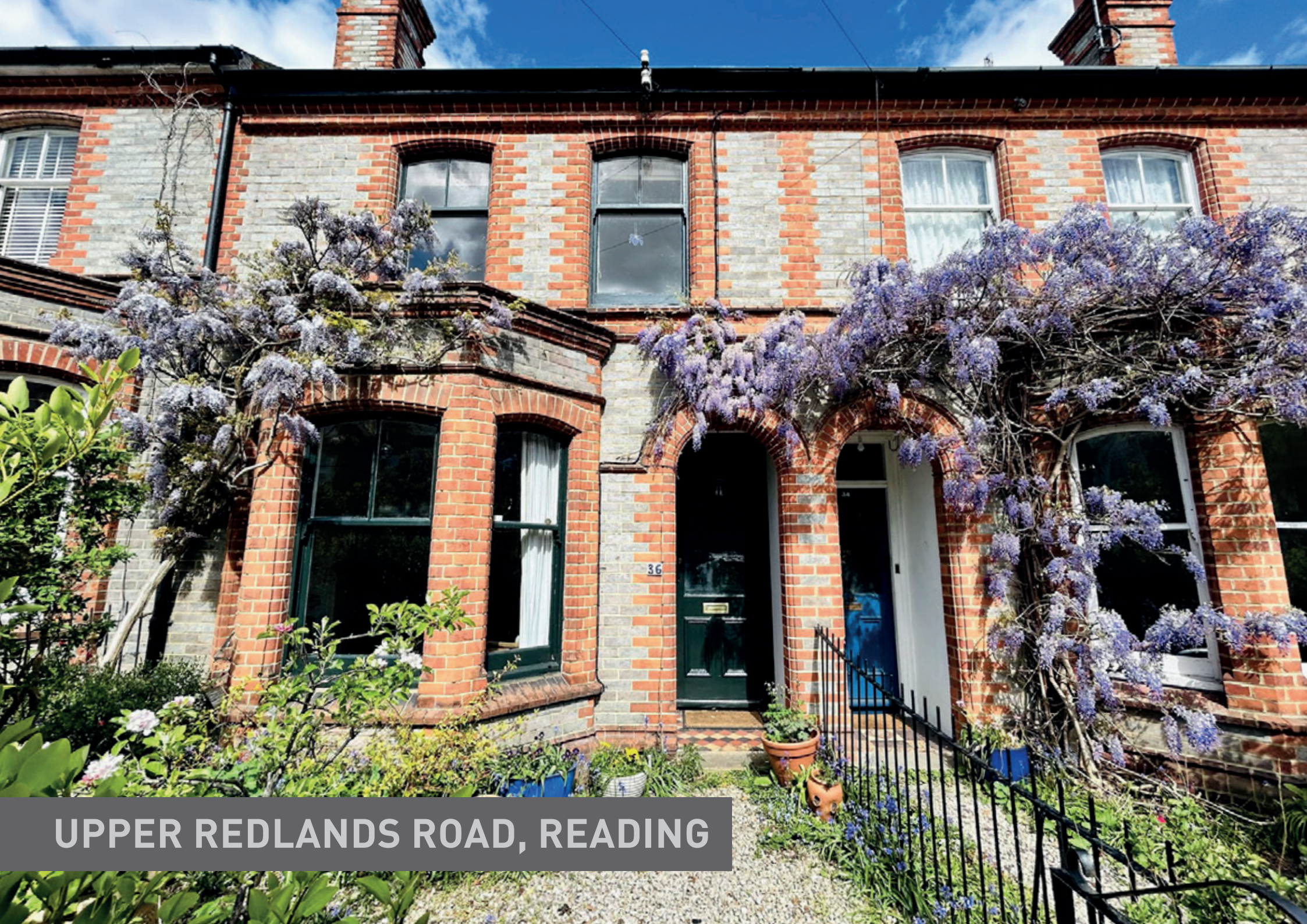
UPPER REDLANDS ROAD, READING